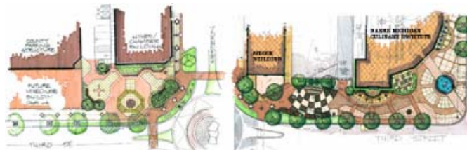
THIRD STREET PROMENADE

A plan for the finishing details along Third Street were unveiled recently with the Third Street Promenade. Pedestrian amenities along Third Street will public art, a fountain, elevated presentation areas, a rain garden, benches, and decorative paving throughout. Currently, downtown promoters are seeking private, named, donations to help off set some of the cost of these public amenities. Progress is already being made on the first phase of implementation as streetscaping alongside the Hines Building is in place. More information can be found at downtownmuskegon.org .