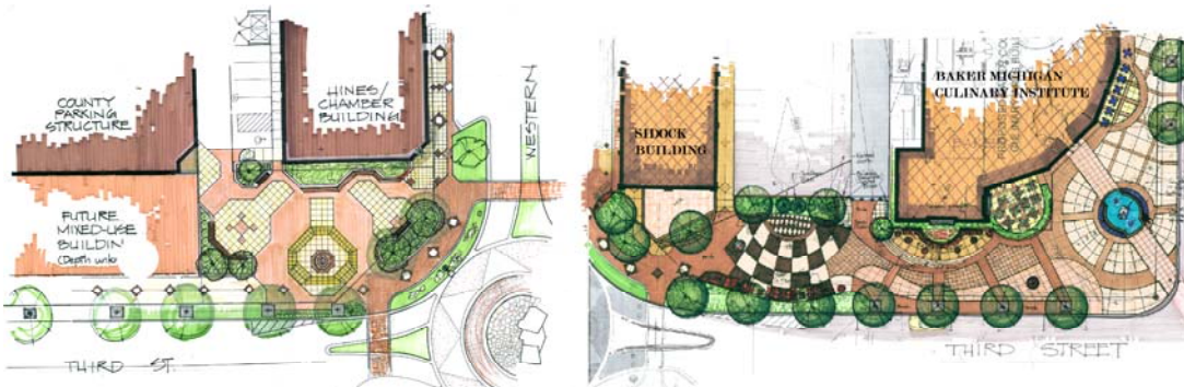
THIRD STREET PROMENADE

Ph: 231-724-3180 Web: www.downtownmuskegon.org Email: drinsema-sybenga@muskegon.org